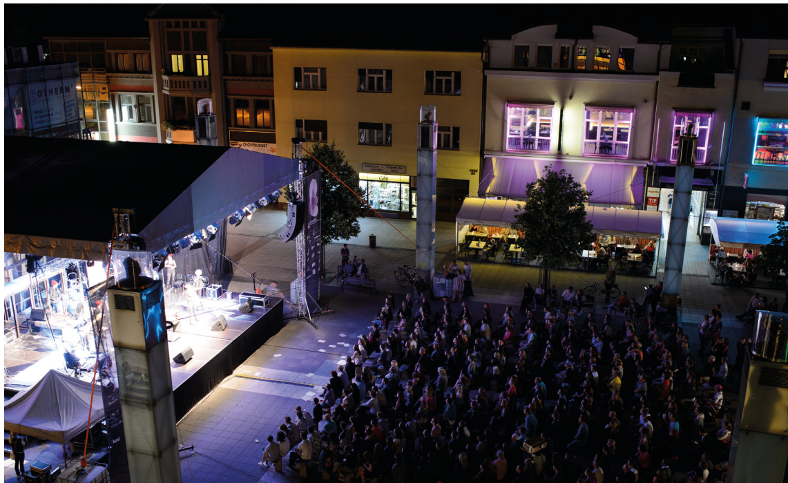
Touches and Connections Festival

The Touches and Connections is a selective non-competitive festival presenting the current production of professional theatres in Slovakia. The festival's ambition is to seek out and present the most interesting and inspiring theatre productions. The dramaturgical council constructs the festival's programme with the aim of capturing the most significant trends and problems of the Slovak theatre in its content, formal and genre diversity. It also provides viewers with the opportunity to discuss with filmmakers and theatre critics. In 2018, the festival presented 35 theatrical performances produced by 26 Slovak theatres + accompanying program. More than 10 thousand spectators attended the festival.