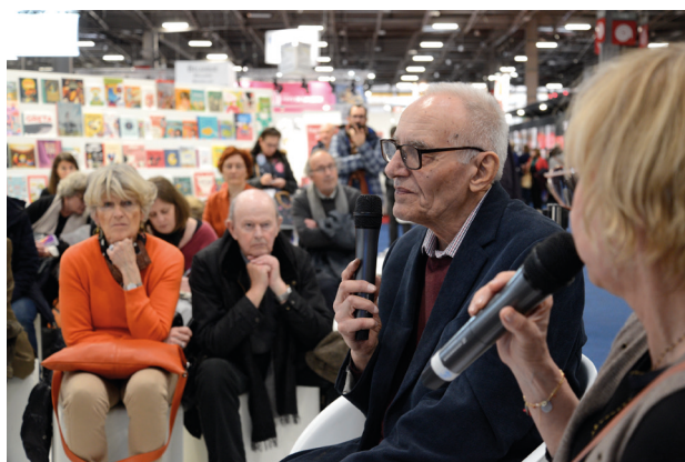
Livre Paris 2019 Book Fair

In 2018, literarnyklub.sk organized more than 100 events, such as the LiKE 2018 festival in Košice and Autoriáda festival in Bratislava, the programme series Čau o piatej, Art debut or Literárny stan at the Pohoda festival.