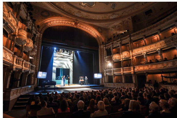
The Dosky Awards