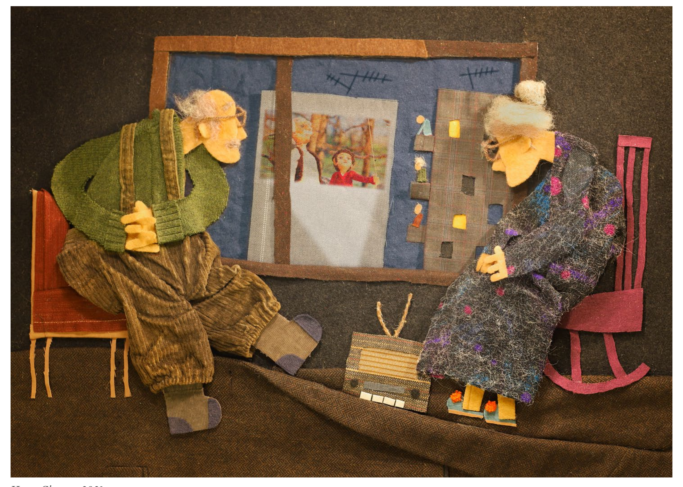
Home Cinema, 2021