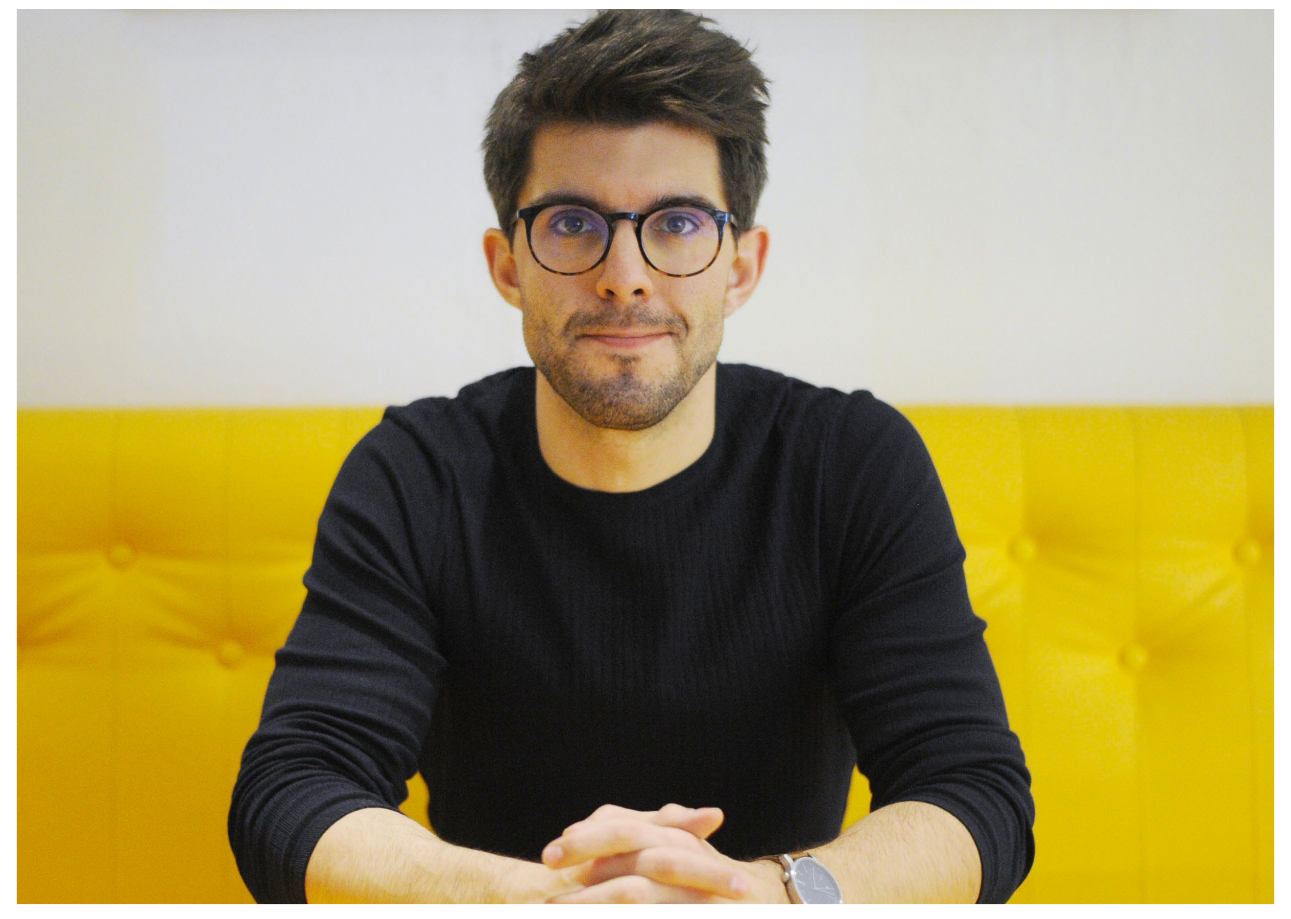
Martin Smatana / photo © Martin Smatana