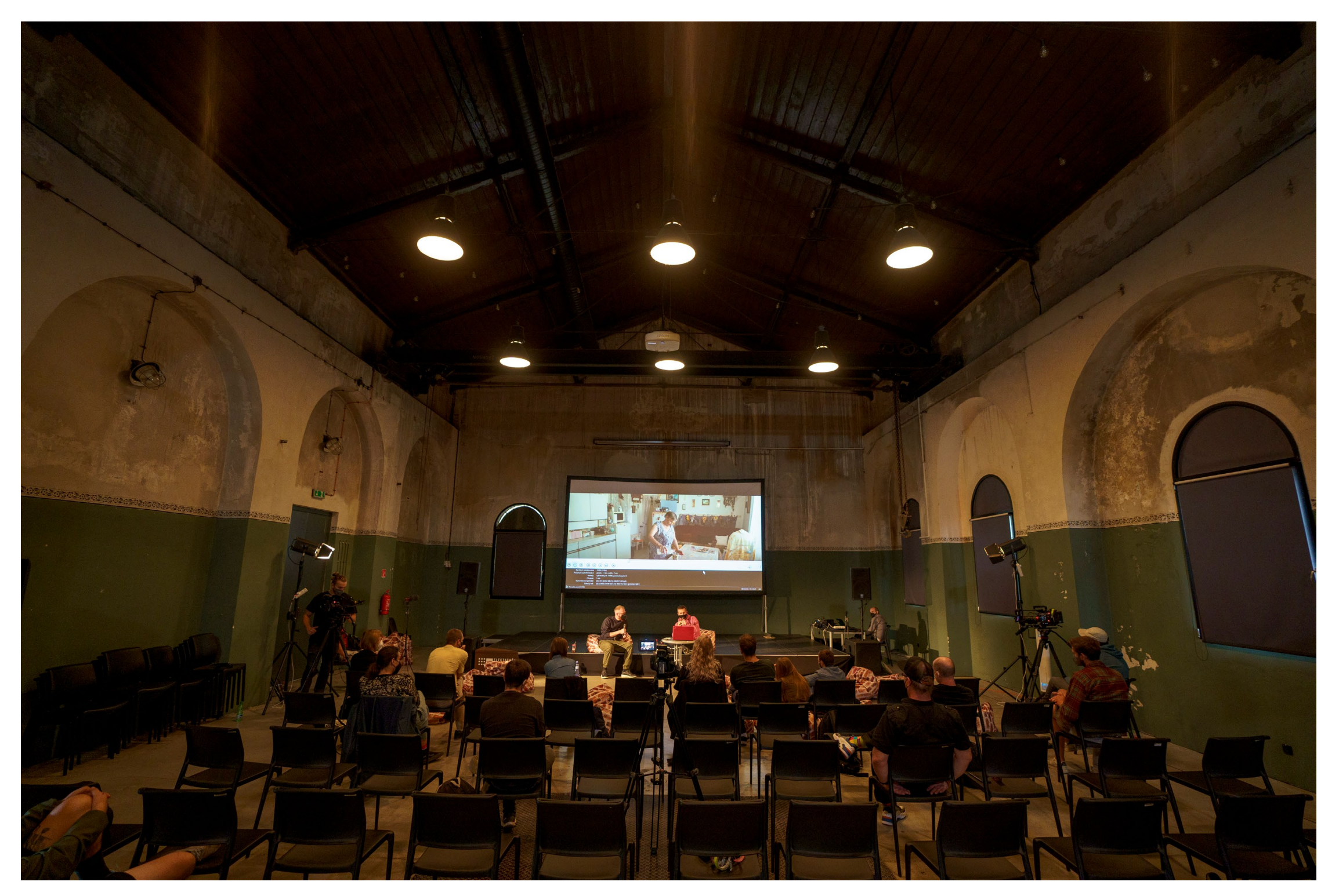
International Film Festival Cinematik Piešťany 2021

In 2021, we extended options for LITA Fund contributions to association members. Since last year, these authors can apply for contributions to mobilities – trips related to presenting their works and representing Slovak art. This support focuses on the presentation of Slovak art – for example attending award shows or presenting works at festivals and expert events. These applications are also assessed by the LITA Committee and the director of LITA during joint meetings. Despite the problematic pandemic situation, we supported two authors' trips in 2021 with € 1,000. We also supported authors and their families by providing four contributions from the Social Fund amounting to € 5,000 in total.