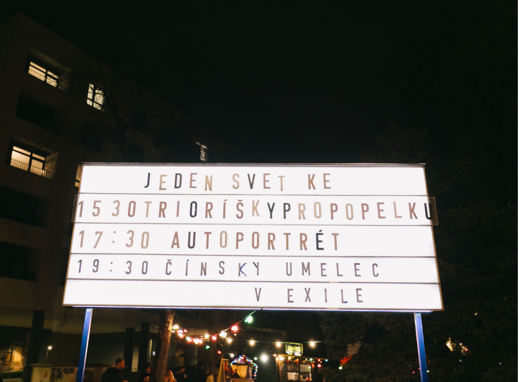
One World Košice 2020