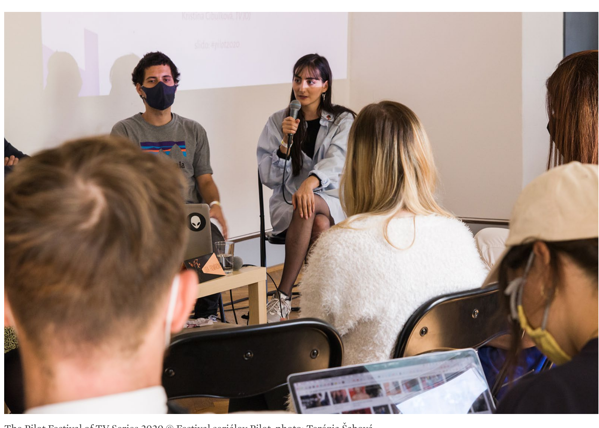
The Pilot Festival of TV Series 2020

The Fest Anča International Animation Festival brings together