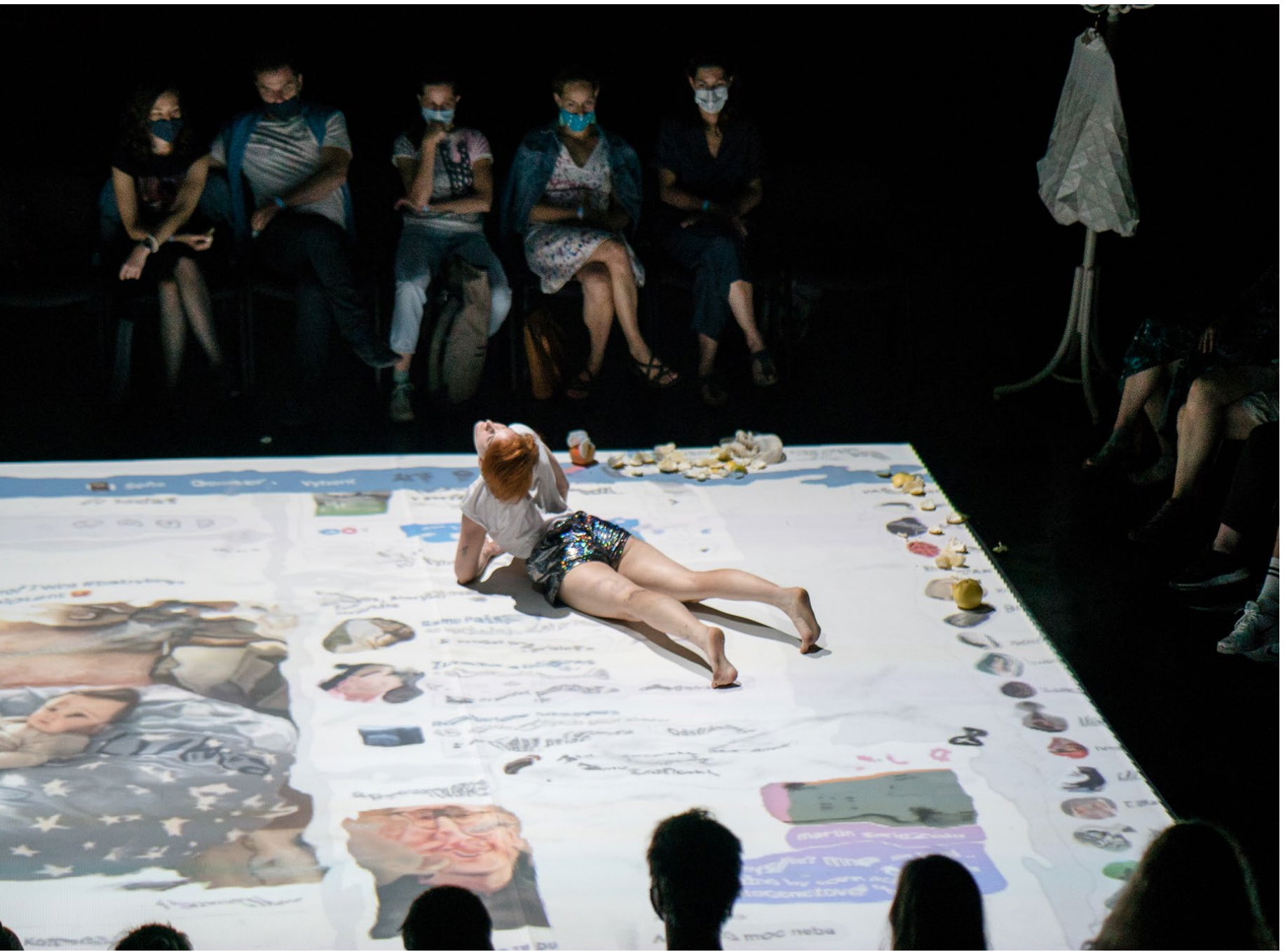
Nu Dance Fest 2020